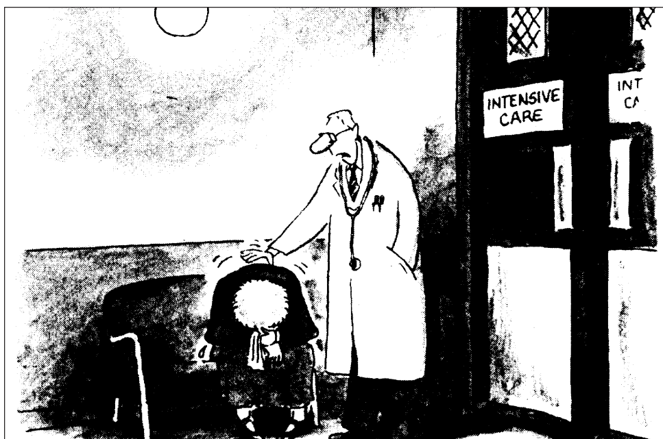
“His final wish was that all his medical bills be paid promptly.”