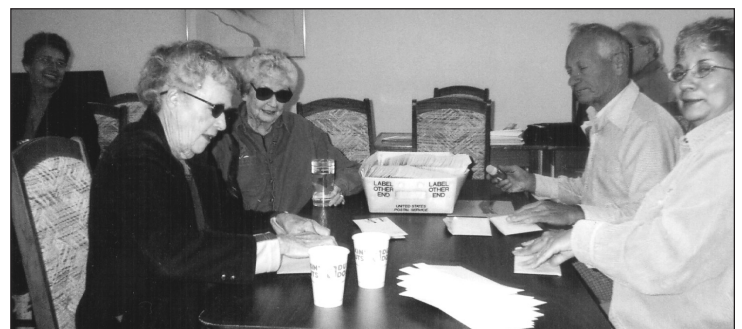
Volunteers assemble fundraiser mailing.