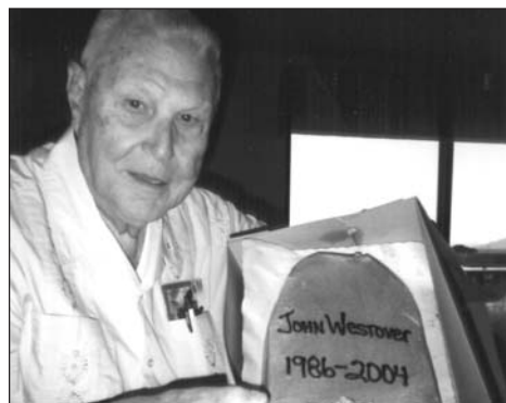
Tombstone for EOLC retirement—not life!

A killing spree hits a peaceful community and the killers are showing no mercy ... or are they?